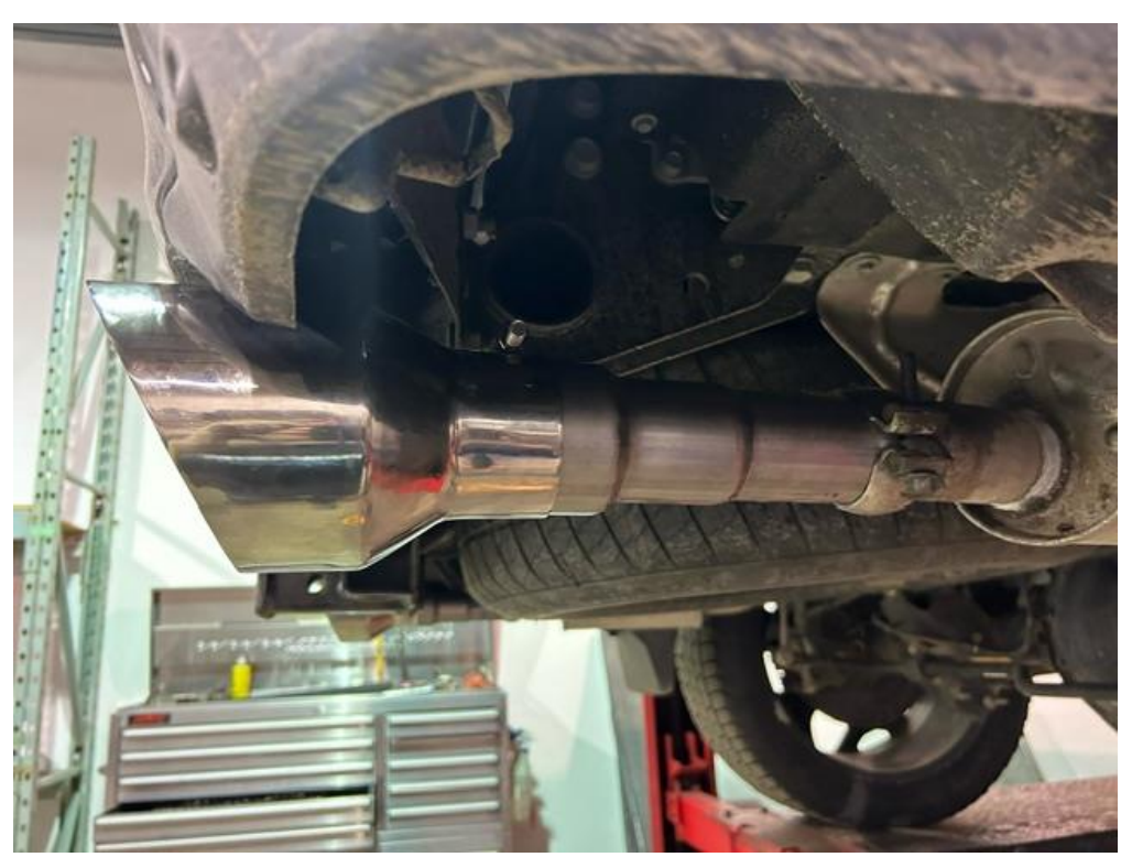
Congratulations! You are ready to begin experiencing the improved appearance of your MBRP Exhaust Tips. We know you will enjoy your purchase!

3. Verify that all hardware is tight, and the Exhaust Tips are fully secure with even clearance from the bumper opening.