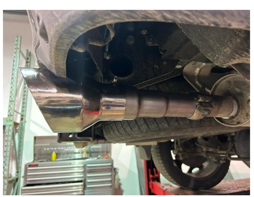
Congratulations! You are ready to begin experiencing the improved appearance of your MBRP Exhaust Tips. We know you will enjoy your purchase!

3. Verify that all hardware is tight, and the Exhaust Tips are fully secure with even clearance from the bumper opening.