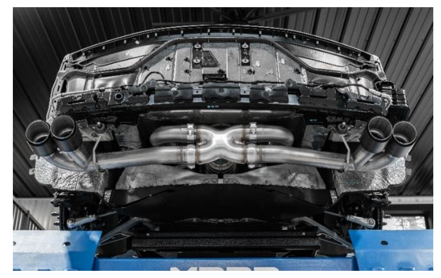
Congratulations! You are ready to begin experiencing the improved power, sound and driving experience of your MBRP Performance Exhaust. We know you will enjoy your purchase!