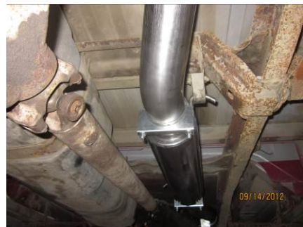
Figure 9 (Hanger may not be same as shown)