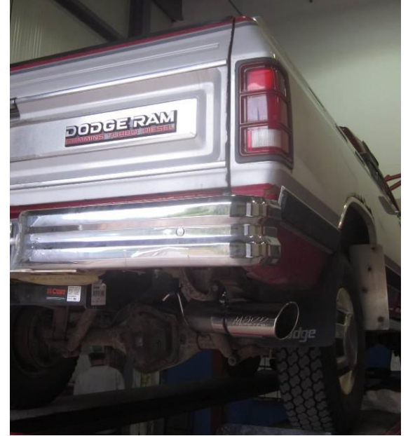
Congratulations! You are ready to begin experiencing the improved power, sound and driving excitement of your MBRP performance exhaust system. We know you will enjoy your purchase.

11. Ensure all clamp connections are secure and components are unable to rotate or slide. Band clamps require approximately 45 lb-ft (60 Nm) of torque. Verify clearances, system security and band clamp torque after 30-60 miles (50-100 km) of driving.