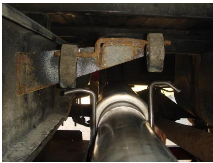
Figure 6 (Hanger may not be as shown)