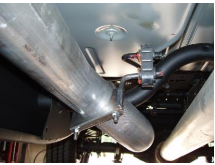
Figure 2 (Hanger may not be as shown)