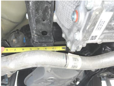
Figure 1 Driver-Side