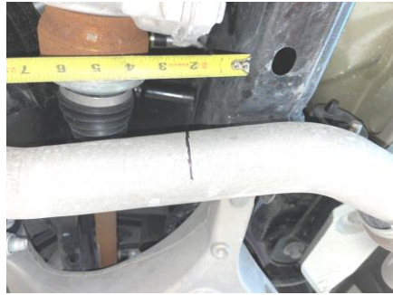
Figure 2 Passenger-Side