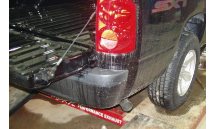
Figure 9 S5134 © 07/20

6. Tighten all hardware and clamps, starting at the front and working rearward to secure the system. Check along the full length of the exhaust system to ensure there is adequate clearance for fuel lines, vent lines, brake lines, frame, bodywork, suspension, and any wiring, etc. If there is any interference detected, relocate, or adjust to provide adequate clearance. Ensure all clamp connections are secure and components are unable to rotate or slide. Band clamps require approximately 45 lb-ft (60 N-m) of torque. Verify clearances, system security and band clamp torque after 30-60 miles (50-100 km) of driving.