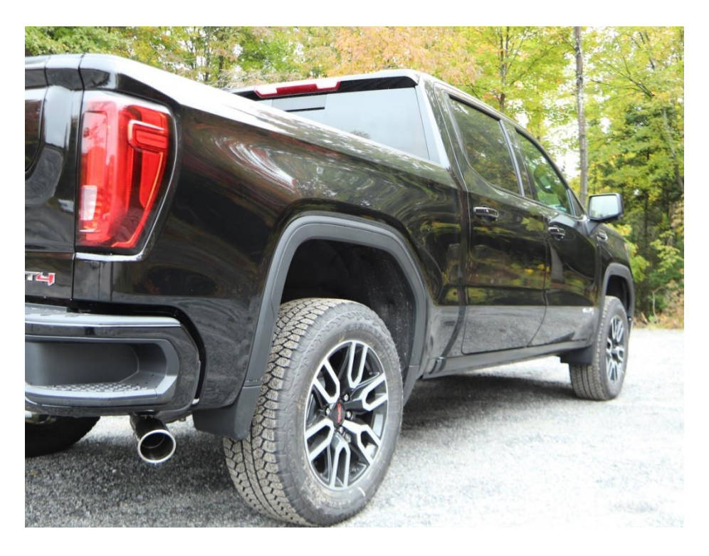
Congratulations! You are ready to begin experiencing the improved power, sound and driving experience of your MBRP Performance Exhaust. We know you will enjoy your purchase!

8. Ensure the Front Pipe Hanger is level where it passes through the rubber insulator. Tighten all hardware and clamps, starting at the front and working rearward to secure the system. Check along the full length of the exhaust system to ensure there is adequate clearance for fuel lines, vent lines, brake lines, frame, bodywork, suspension and any wiring, etc. If there is any interference detected, relocate or adjust to provide adequate clearance. Ensure all clamp connections are secure and components are unable to rotate or slide. Band clamps require approximately 45 lb-ft (60 N-m) of torque. Verify clearances, system security and band clamp torque after 30-60 miles (50-100 km) of driving.