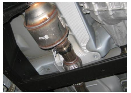
clamp for the installation. Refer to Figure 3 .

3. Remove the clamp behind the catalytic converter and save the