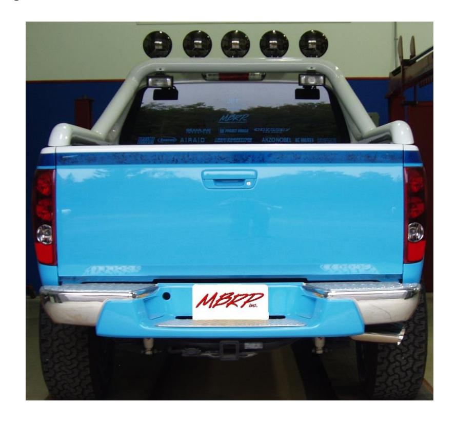
Congratulations! You are ready to begin experiencing the improved power, sound and driving experience of your MBRP Performance Exhaust system. We hope you enjoy your purchase.