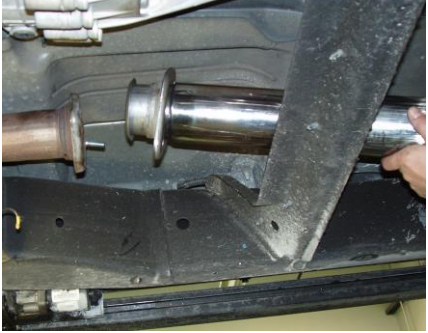
Figure 5 $5042 © 10/20