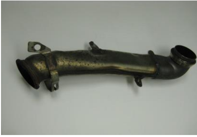
Stock Down Pipe Figure 6